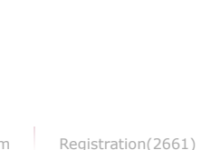
Dust cap for BNC Jack connector KLS1-BNC013