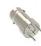
PCB Mount BNC Connector KLS1-BNC001