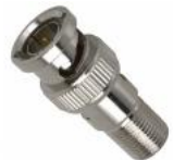
BNC plug male to F jack,75Ω KLS1-BNC031