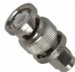
BNC Male To SMA male,50Ω KLS1-BNC035