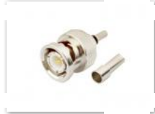
BNC Connector for RG174 KLS1-BNC142