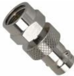
BNC female to F male ,50Ω KLS1-BNC033