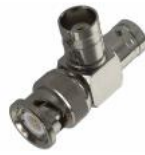
BNC Adapter KLS1-BNC028