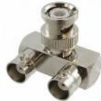
BNC Adapter KLS1-BNC030