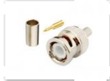
BNC Connector Cable Mount KLS1-BNC148