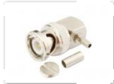
BNC Connector for RG58 KLS1-BNC173