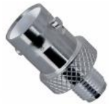
BNC Female To SMA Female,50Ω KLS1-BNC036