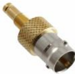
BNC female to 1.0/2.3 Jack,75Ω KLS1-BNC022B