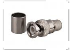
BNC Connector for RG59 50Ω KLS1-BNC176