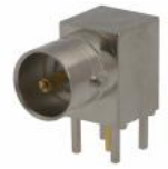
PCB Mount BNC Connector KLS1-BNC011