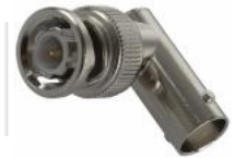
BNC Adapter KLS1-BNC020