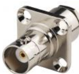
BNC Connector for RG58 KLS1-BNC138