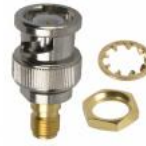
BNC Male To SMA Female,50Ω KLS1-BNC034