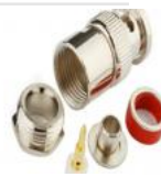
BNC connector for LMR300 KLS1-BNC171