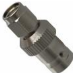
BNC Female To SMA Male,50Ω KLS1-BNC037