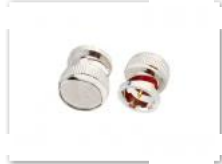
BNC Connector for RG58 KLS1-BNC143