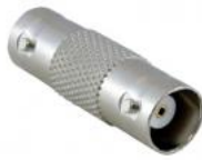
BNC female to BNC female ,50Ω KLS1-BNC027