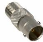
BNC female to F jack,75Ω KLS1-BNC032B