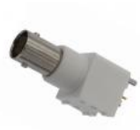
PCB Mount BNC Connector KLS1-BNC002