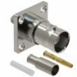
Panel Mount BNC Connector KLS1-BNC016