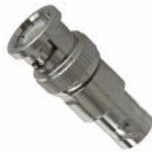
BNC Adapter KLS1-BNC025