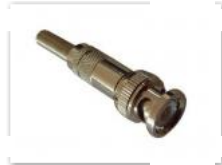
BNC Connector for LMR240 KLS1-BNC175