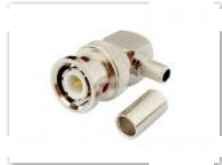
BNC Connector for RG58 KLS1-BNC174