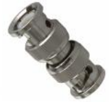
BNC Adapter KLS1-BNC023