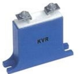
MYE30 Terminal A Type